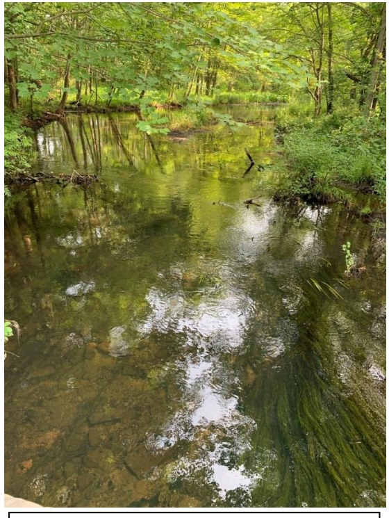
The Succasunna Brook running under Righter Road at the Alamatong Wellfield Open Space Property

One of the MCMUA's responsibilities is to be a good steward of its watershed properties. The open space trust was created with overwhelming support to protect lands that ensure both safe and sustained drinking water supply for the population for County of Morris. Acquiring and managing lands to protect drinking water resources is a responsibility the MCMUA accepts and will strive to maintain. This plan defines activities to ensure that the water resource values of these properties are retained over time.